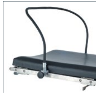
Anesthesia screen Provides a sterile barrier separating the surgical field from the patient's head.