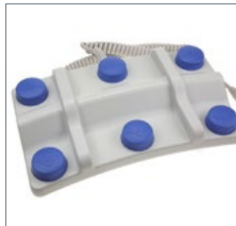
imagiQ2 foot control Compact multipedal footswitch for discrete placement beneath the table with soft touch buttons and a light operating force.

The Stille imagiQ2 comes with the following configuration: