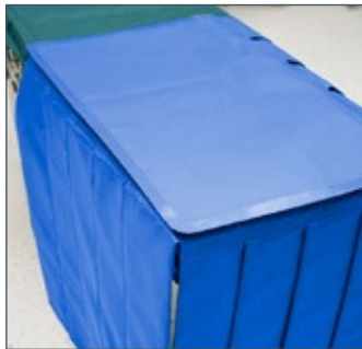
imagiQ2 radiation shield Tailored and easy to fit protection against scattered radiation with lead rubber (0.5 Pb) material. Not available in the US.