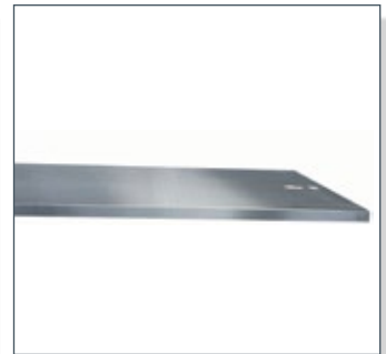
Catheter tray Provides an extended work space, which is attached directly to the table. Available in three lengths.