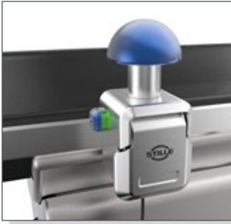
Extra pan handle Extra pan handle allows panning the table from different sides