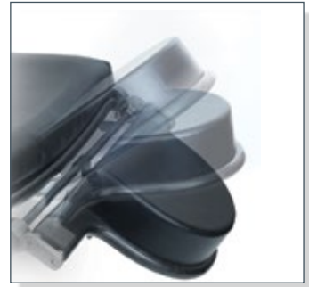
Adjustable procedure headrest Fully translucent headrest, ensures easy intubation and superior carotid visualization. It fits the free end of the table and is side rail mounted.