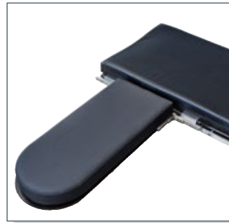
Translucent fistula arm board Provides an unobstructed image and is connected directly to the carbon fiber top.