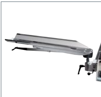
Adjustable arm board Nontranslucent board provides ideal support for the patient's arm during IV.