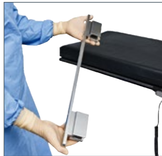
Detachable side rail One third rail system enabling full table length side rails, accessory mounting and optional 360° imaging capabilities.