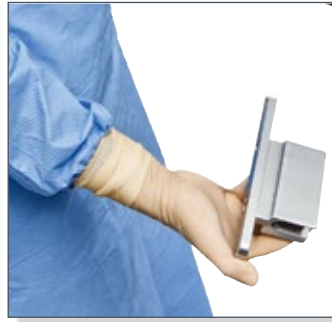
Detachable short side rail Short 8 in / 20 cm rail system enabling accessory mounting and 360° imaging capabilities.